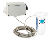
IP41 Remote Sensor Kit AS R13