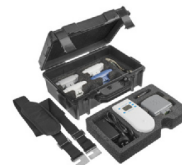
Carry Case Large AS R41