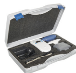
Carry Case Small AS R40