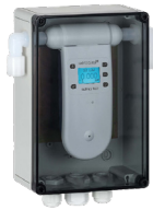
Industrial Enclosure HH ENC