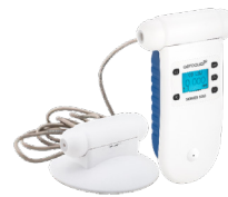
Remote Sensor Kit AS R10