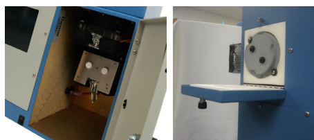
Thermo Scientific™ TEOM™ 1405-F Monitor

The system differentiates itself from other PM measurement methods by utilizing a direct mass measurement that is not subject to measurement uncertainties found in surrogate techniques such as beta attenuation, light scattering and pressure drop.